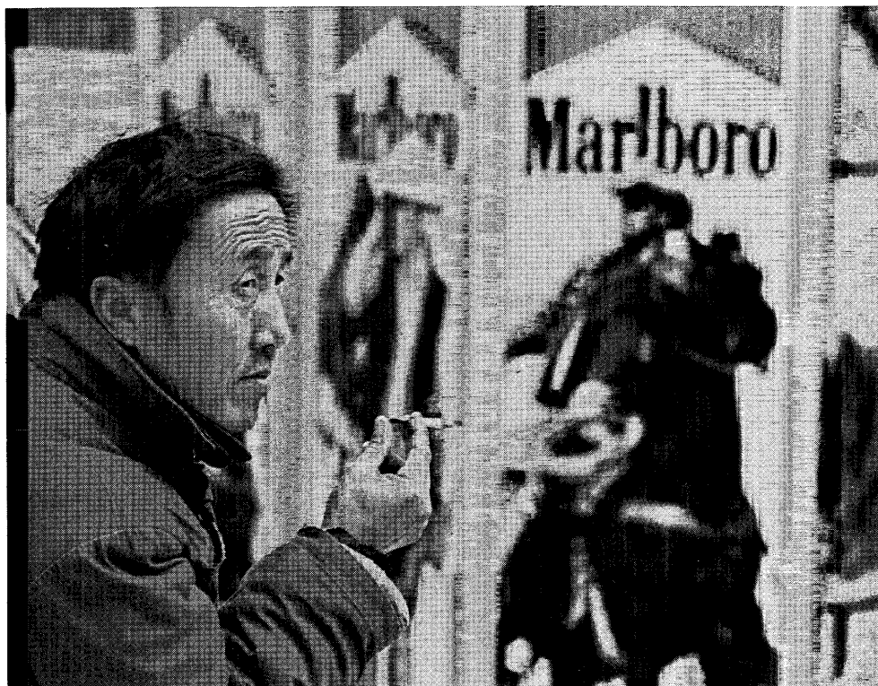
Philip Morris moving into Asia